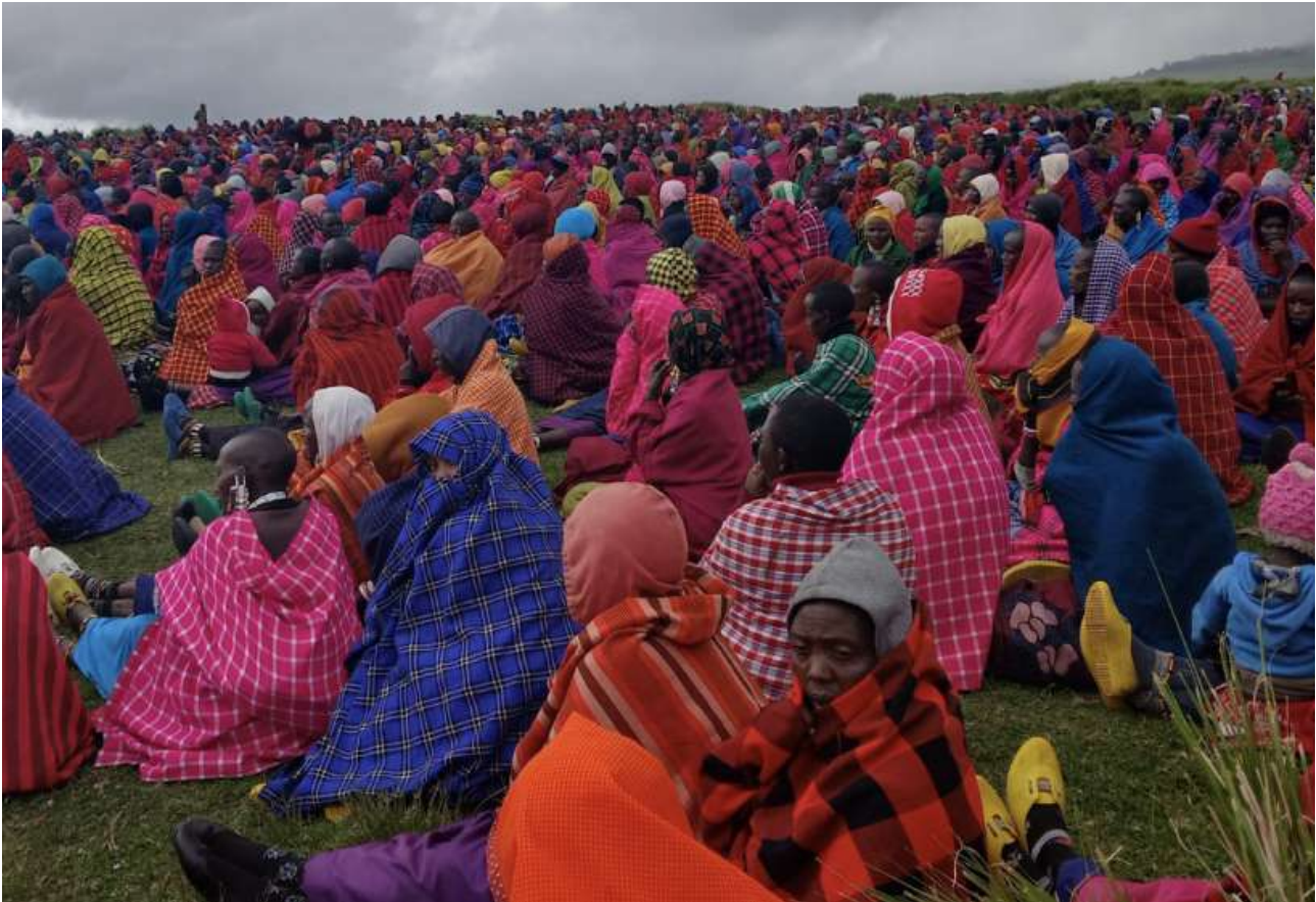
Photo: Ngorongoro people waiting to present their case to the Presidential Commission