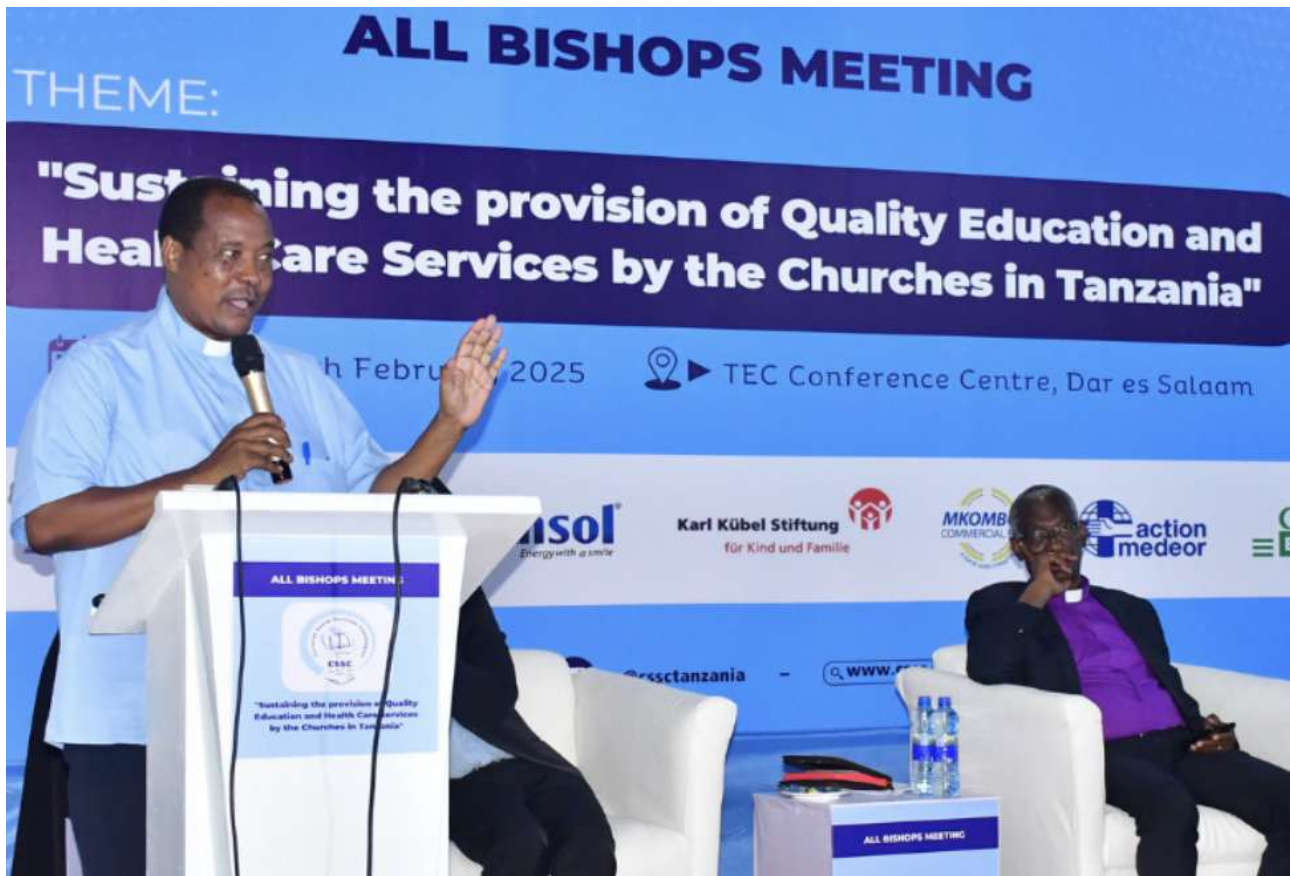
Photo: Fr Kitima (CIDSE). Source: Ein Angriff auf die Stimme der Kirche in Tansania - Misereor-Blog