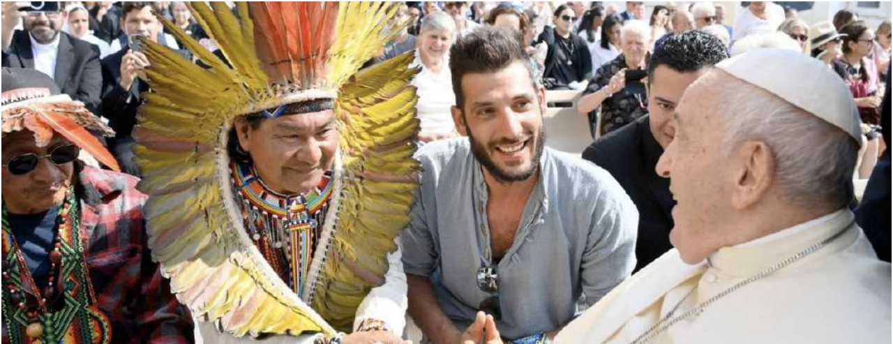
Photo: Pope Francis meeting Indigenous Leaders (2023). Source: Vatican Media