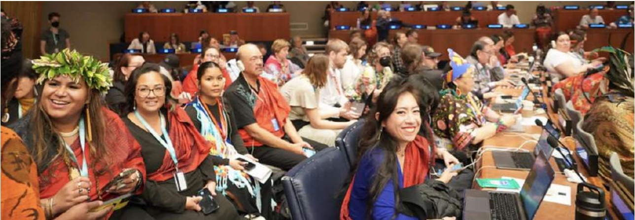
Photo: Delegates at UN Permanent Forum on Indigenous Issues